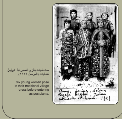
ست شباهت بالزي الشعبي قبل قبولهن كطالبات (الموصل ١٩٢٩).